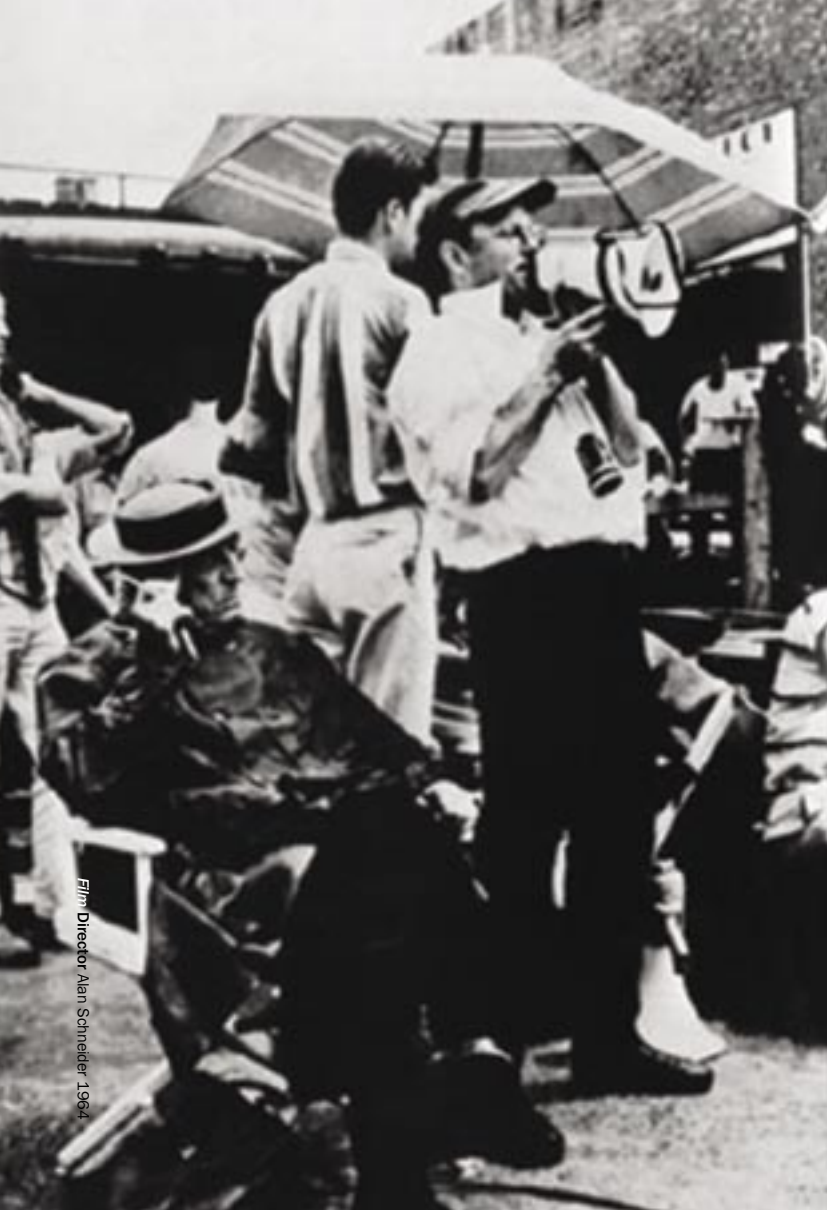
Film Director Alan Schneider 1964