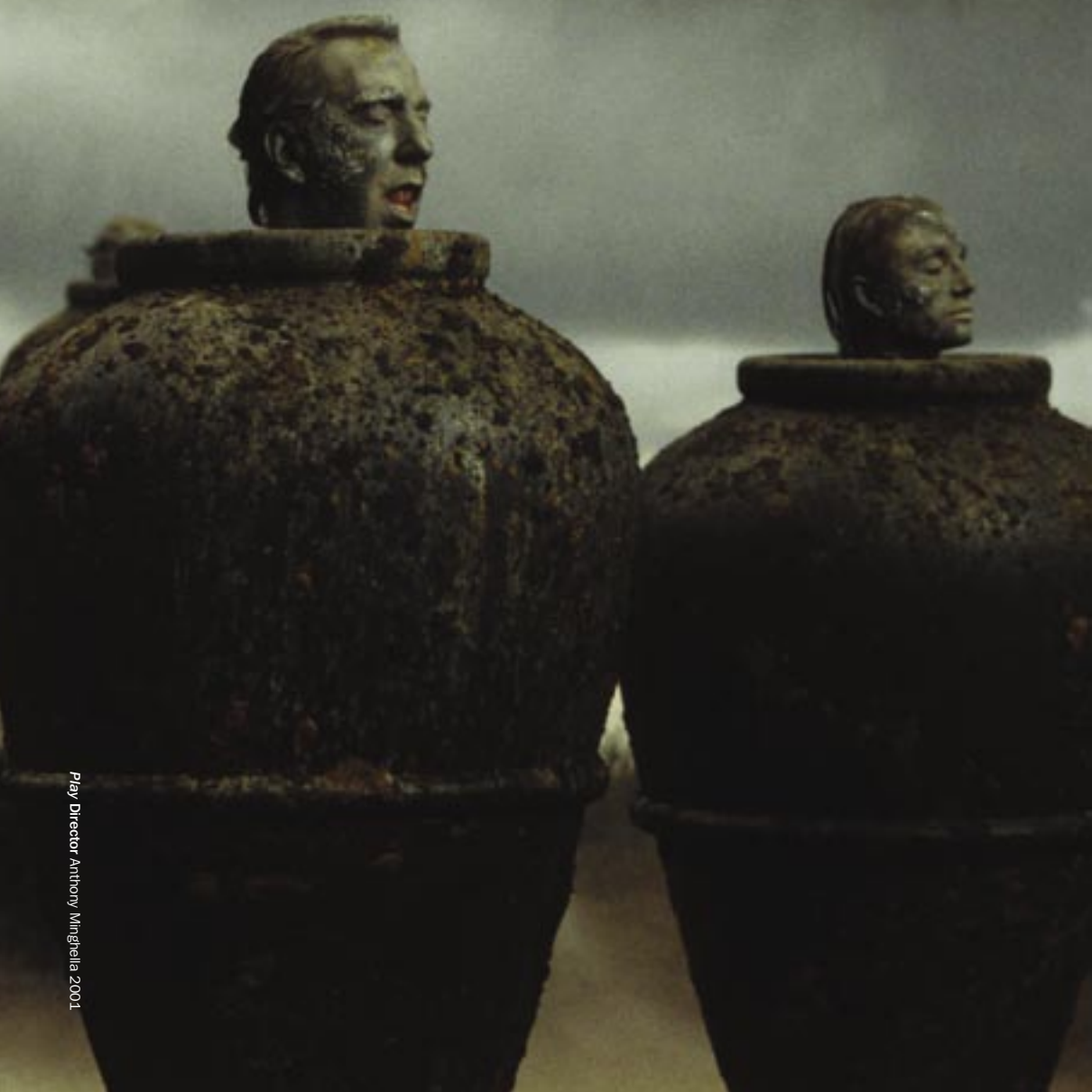
Play Director Anthony Minghella 2001