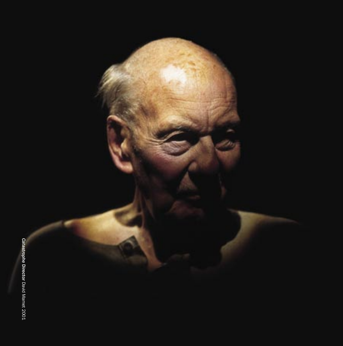
Catastrophe Director David Mamet 2001